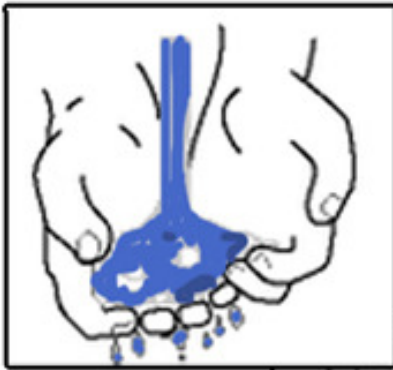
1. Wet Hands